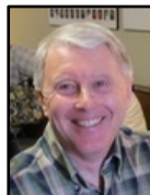
Dennis Eaton Communications