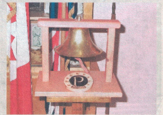
FIGURES #1 AND #2