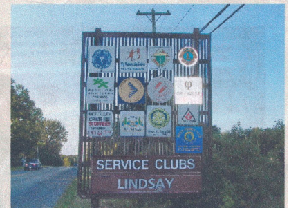
SERVICE CLUB BOARD (LINDSAY STREET SOUTH)