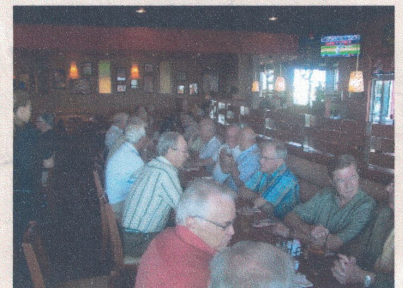
LUNCHEON PICTURES AT BOSTON PIZZA