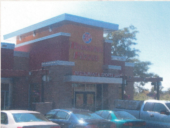
NEW BOSTON PIZZA LOCATION KENT STREET WEST