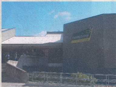
SIR FLEMING COLLEGE