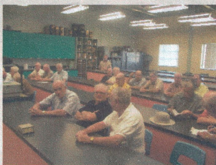
CLASSROOM PRESENTATION AND TOUR THROUGH DISPLAYS THROUGHOUT THE COLLEGE FACILITY