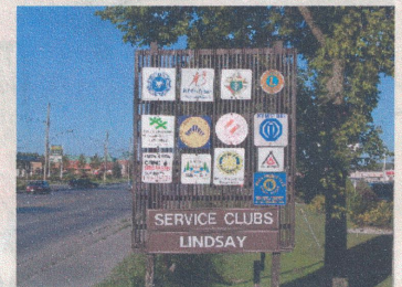
SERVICE CLUB BOARD (KENT STREET WEST)