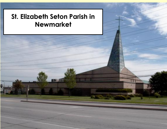
St. Elizabeth Seton Parish in Newmarket