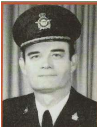
Colonel Morris Gates (no recent picture available)

"Keith Greenaway - a Canadian Icon in Arctic Navigation"