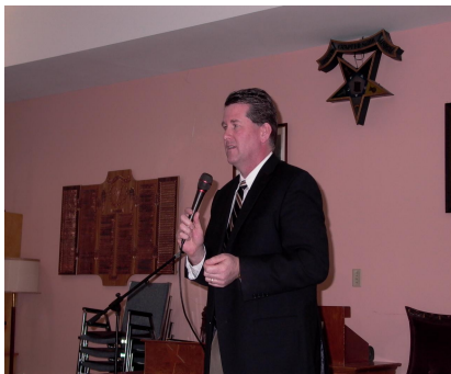
Mayor Ric McGee