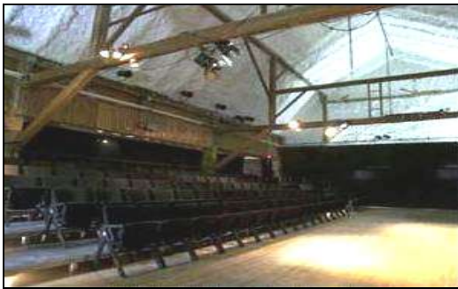
Picture image of Globus Theatre's stage and seating area.