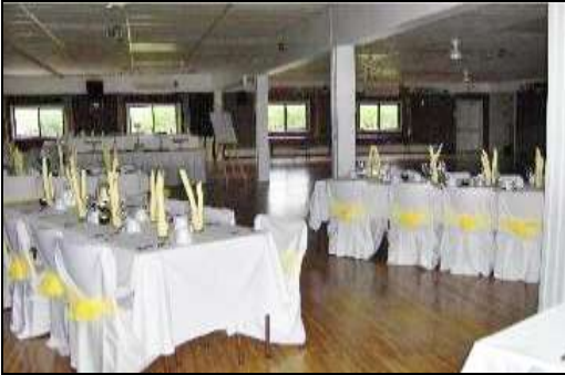
Picture image shows the banquet hall where the Christmas luncheon was held.