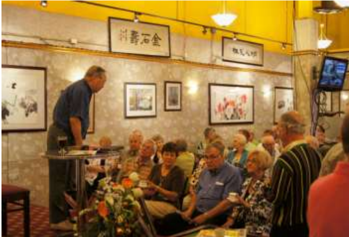
Oriental Markham Trip – June, 2011