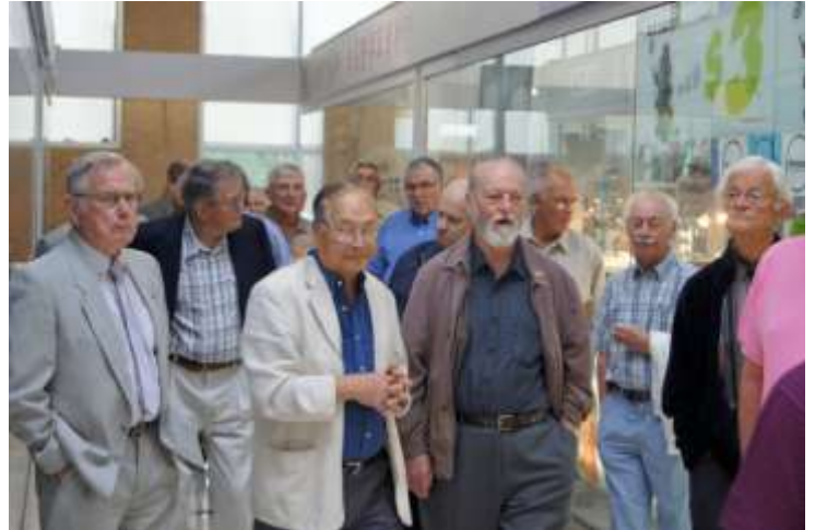
Oriental Markham Trip – June, 2011