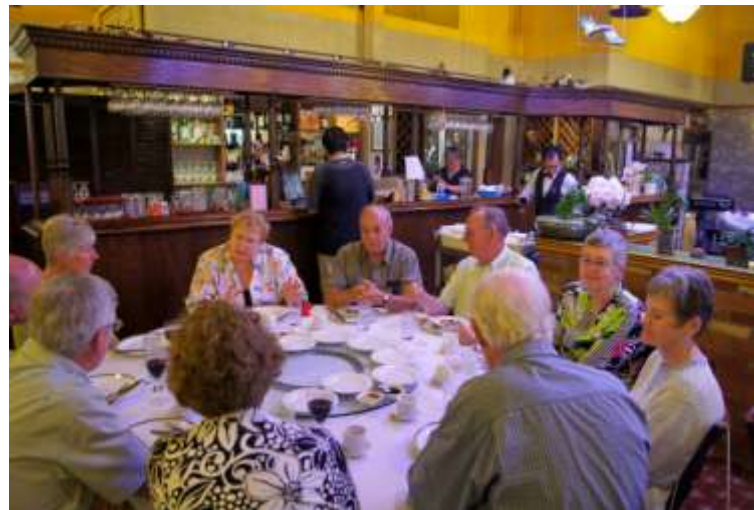
Oriental Markham Trip – June, 2011