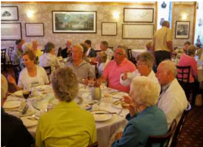
Oriental Markham Trip – June, 2011