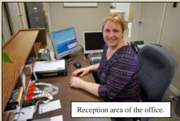
Reception area of the office.

During those years, I have been activity involved in the following organizations: