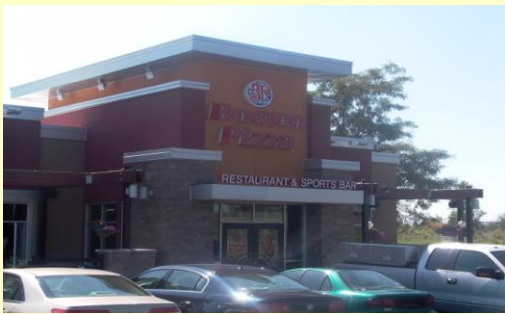
Boston Pizza – Luncheon