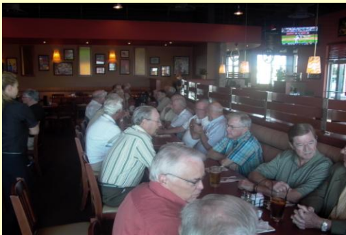
Probus Club – Archive Pictures