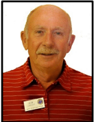
Bob Barkwell Corporate Services