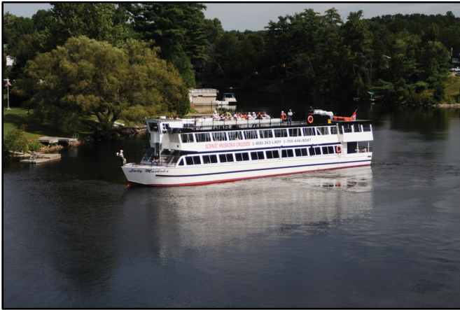
Above is a photo of the cruise boat Lady Muskoka. You can obtain further information about the cruise at www.ladymuskoka.com